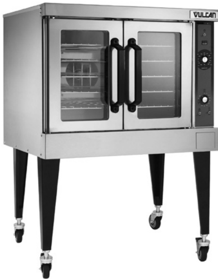
Model VC4ED Shown with optional casters