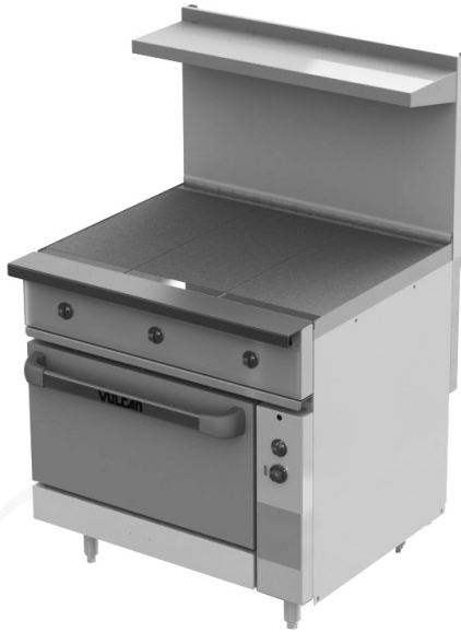
Model EV36S-3HT208 shown with adjustable legs