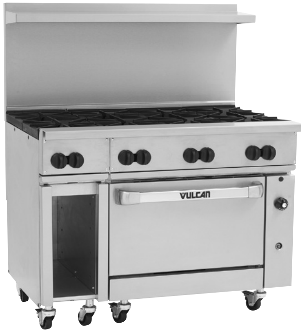
Model 48S-8BN (shown with optional casters)