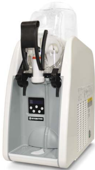
Stoelting® Mini Soft Serve Countertop Freezer