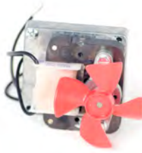
#12810 - Motor 220V