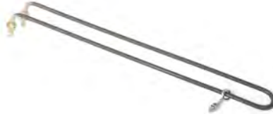
#10518 - Heating Element 208V