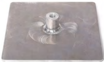
#11640 - Skewer Stand