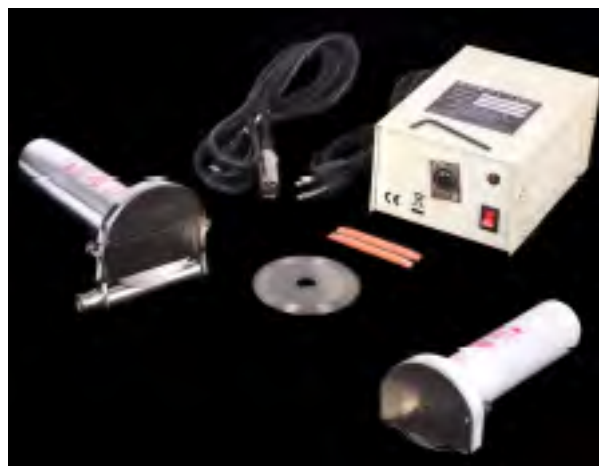
#20000 - Super Gyros Knife Stainless (80mm Blade)