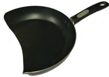
#12000 - Catch Pan