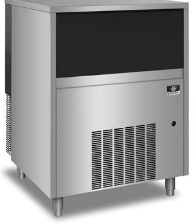
Model UNK-0200A Nugget Ice Machine