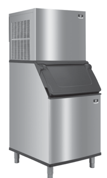
RNF-1100A Nugget Ice Machine on D-570 Bin