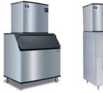
IDF-1800C Ice Machine on a D-970 Bin