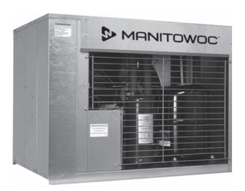
CVDF1800 Condensing Unit 208 V