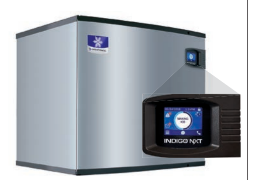
IDF-1800C Ice Cube Machine - 115V