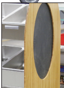
Optional Chalk Sign Board Panel