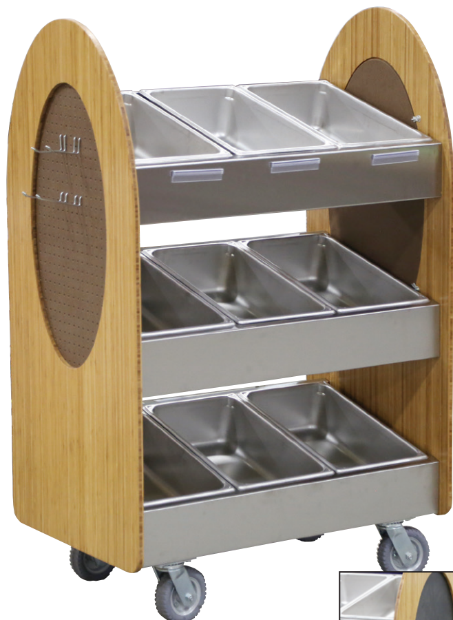
Model 683 (Shown with optional 6" pneumatic casters and peg board panel. Pans shown not included.)