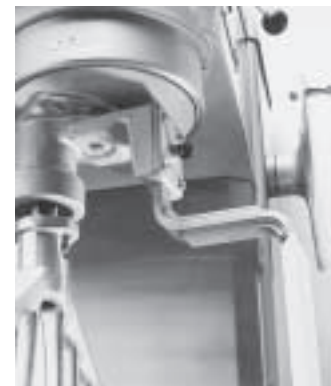
Bowl Scraper continuously scrapes side of bowl while mixing