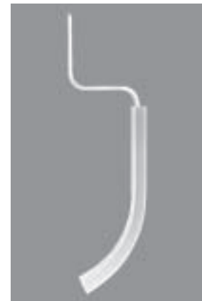
Urethane Elastomer Scraper mounts on stainless steel blade

Specifications, Details and Dimensions on Reverse Side.