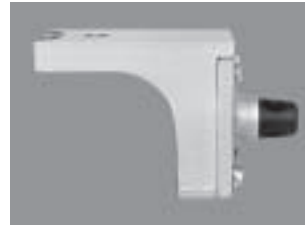
Mounting Bracket is permanently mounted to mixer