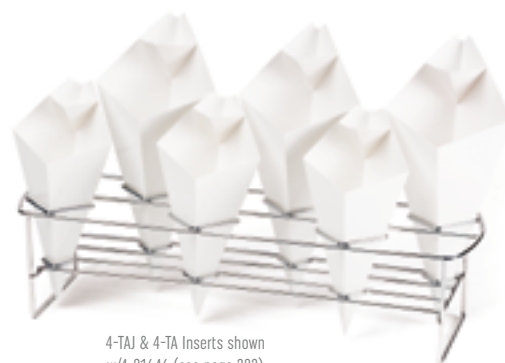
4-TAJ & 4-TA Inserts shown w/4-21646 (see page 323)