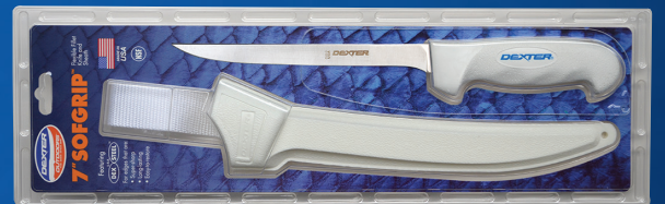
24633 SG133-7WS1-PCP 7" flexible fillet knife w/sheath