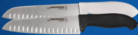
24513 SG144-9GE-PCP 9" duo-edge Santoku knife (NSF)