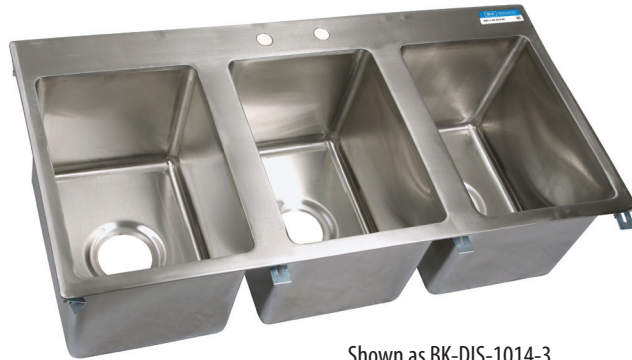
Shown as BK-DIS-1014-3