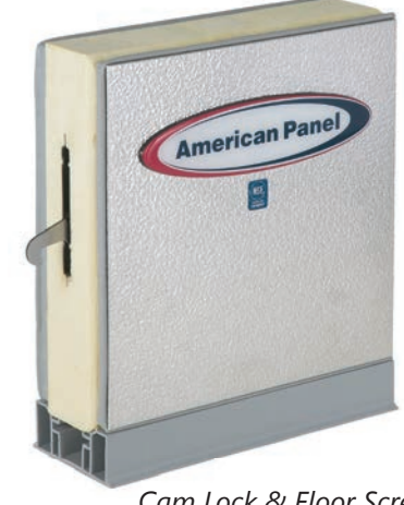
Cam Lock & Floor Screed

American Panel insulated panels are 4" thick high pressure impingement mixed (HPIM), foamed-in-place urethane expanded with HFC-245fa at a minimum of 2.3 lb. per cubic foot density, fully heat cured and bonded to the exterior metal finishes. The thermal conductivity ("K factor) is 0.1232 BTU/Hour/Square Foot/Degree Fahrenheit/Inch of Thickness. Overall coefficient of heat transfer ("U" factor) is less than 8.116 and the resistance to heat penetration ("R" factor) is not less than 32.46 for freezers or 29.04 for coolers.