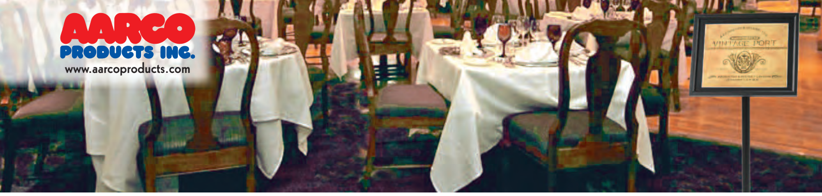
(Artwork shown for illustration purpose only and not included on board)